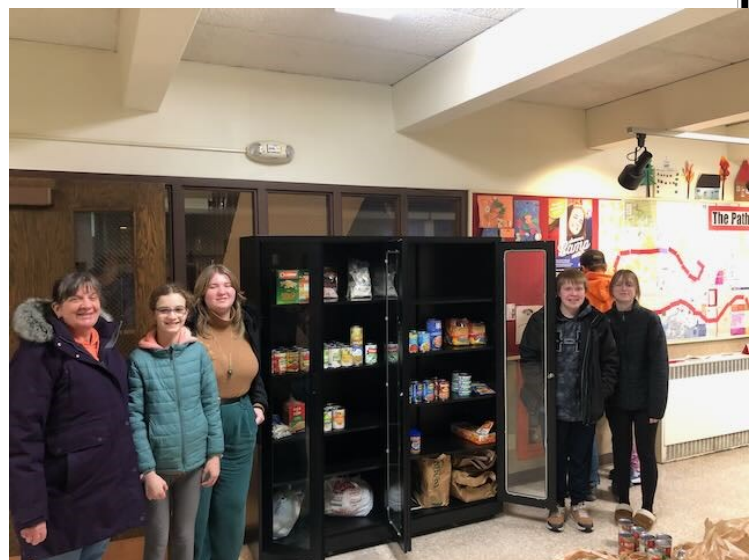
Many thanks to the youth for filling the pantry on February 28th! Funds from the "Souper Bowl of Caring" made their trip to the store possible.