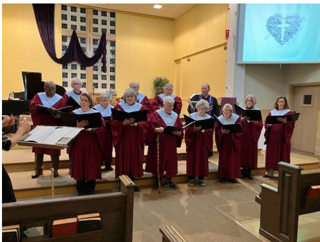
The choir offered a reflective anthem on Ash Wednesday, February 14th.