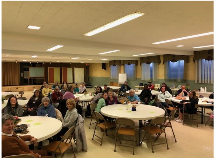
"Food for Thought" Dinner Church celebrates their first birthday on February 28th!