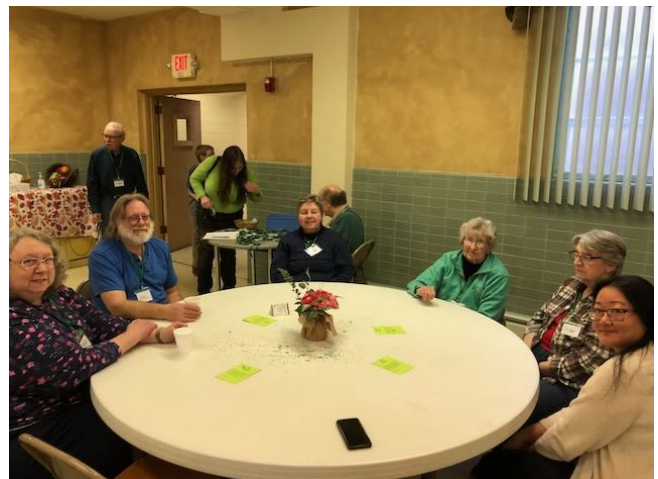
A great crowd for corned beef on Wednesday night March 13!