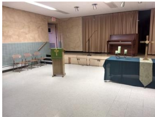
Our downstairs summer worship space! We will utilize this again February 16th & 23rd.