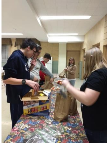
The Youth Group packed sack lunches for our neighbors at COTS on January 22nd.