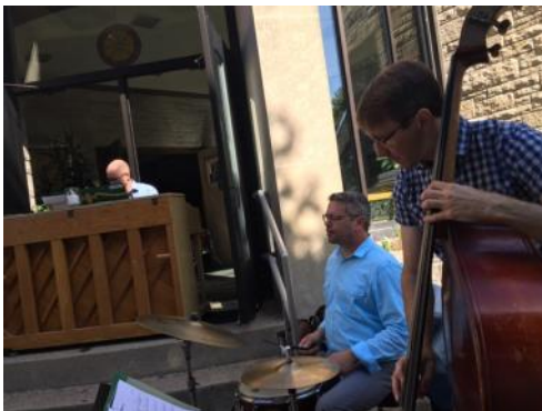
Our outdoor worship on July 21st after the storm, without power.