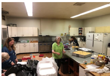
Our Emmanuel team hard at work!

God has been working in amazing ways this past year creating relationships through our Wednesday