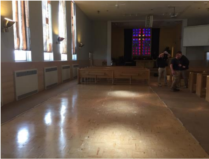
Work began again on Monday, February 10th as the pews were removed. Many were saved by church members and we have kept some here at Emmanuel.