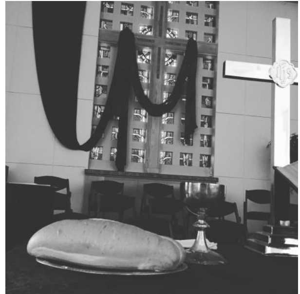
We returned to the Sanctuary for worship on Communion Sunday, March 1st!