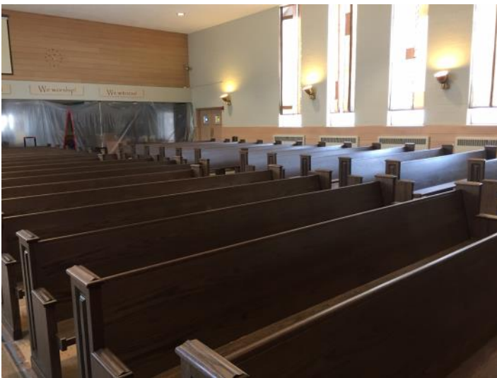
Work almost done! The new pews were installed on Tuesday, February 24th.