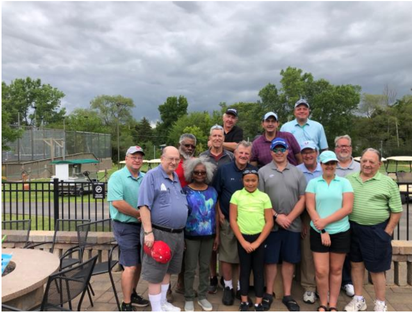
Our Emmanuel golf team at the Senegal Outing! All of our golfers and mini-golfers on August 24th.